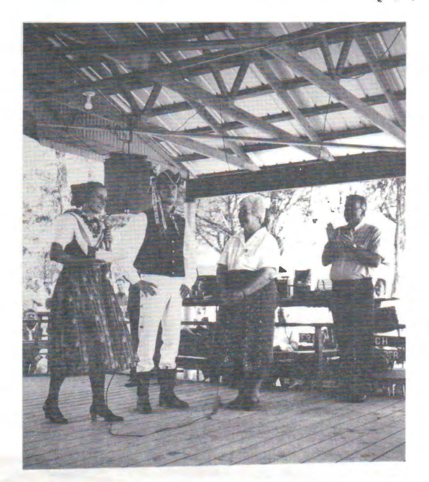
Presentation of dudelsack player's costume for the TWHS Museum