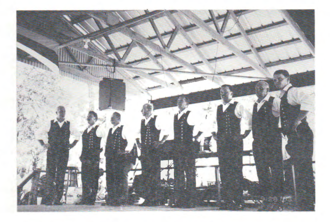
Male dancers with the Trachtentanzgruppe Zeissig