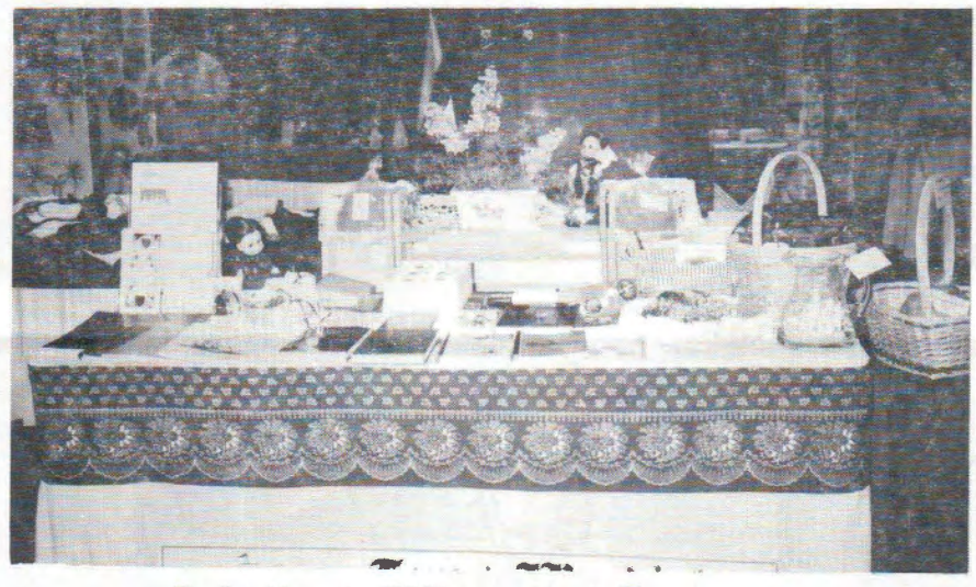
Book table at the CGSI convention in Houston

When the event was over, we returned home tired but proud to know that information shared about the Texas Wendish Heritage Society and Museum was now traveling across the country by car and plane. We had to chuckle at the thought of those bags of noodles waddling along the conveyors toward the x-ray machines at Bush and Hobby airports.