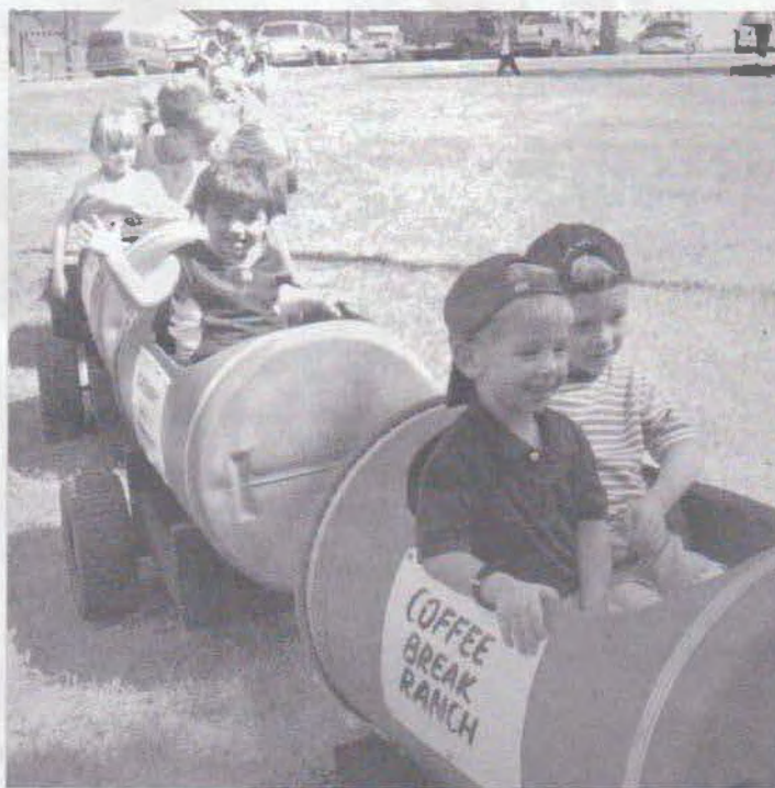
Riding the train!