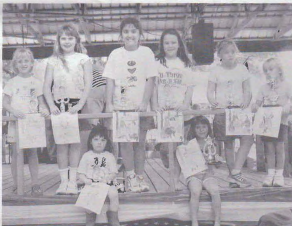
Coloring contest winners