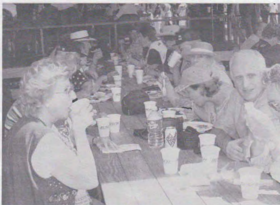
Enjoying a Wendish meal!