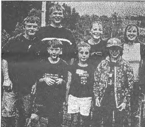
3rd generation present