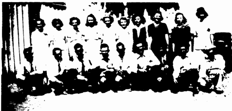
WALTHER LEAGUE 1940'S