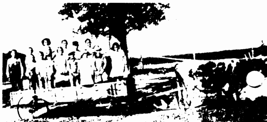
OX DRAWN WAGON WITH SCHOOL CHILDREN