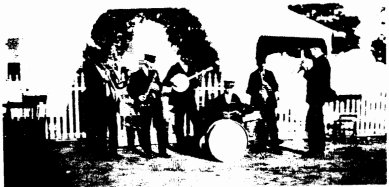
WAGNER-FISCHER BAND