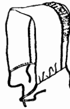
6 Form der einfachen schwarzen Haube Forma jednorozce czarnej hawby