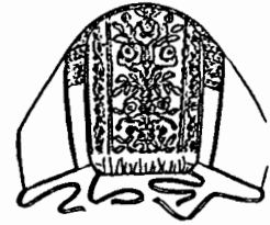
7 Einfache schwarze Haube, Rückseite Jednoroza czarna hawba, wotzady

Have you ever thought about the style of clothing that your ancestors wore before they immigrated to Texas? If so, you might like to do a little research in our Library, as we have several books on the traditional clothing of Lusatia, and some garments on exhibit.