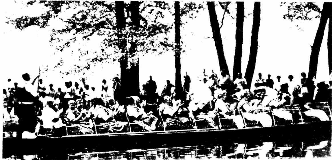
Photo to right: The beautiful parade on the Spree River was enjoyed Sunday, June 26th